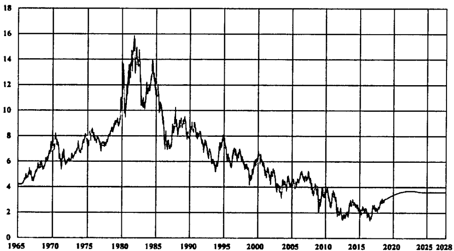
Figure 2: Interest on the 10-year Treasury note—both historical data and future projections. 26

years and is predicted to continue to do so for the foreseeable future, few mainstream Americans, members of Congress, or even those comprising the Executive Branch, have paid any real attention to it. In order to address this very difficult and often ugly situation, substantive debates must first take place. These are unlikely to take place any time soon because to do so would mean addressing the federal budget and ways to get it under control, and Republicans, who were once deficit hawks, have now turned a blind eye to the national debt. 25